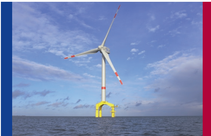
BARD 5.0 offshore wind energy system

The upgraded wind power stations are expected to enter service in offshore projects of the BARD Group over the next few years. Apart from the already approved project "BARD Offshore 1," the BARD Group has meanwhile submitted further applications for approval to the relevant German authority (BSH Federal Maritime and Hydrographic Agency). The total output of all future projects will amount to over 3,000 Megawatt. Applications for three further parks for the Netherlands part of the North Sea are underway. "BARD Offshore 1" will be the first commercial wind park in Germany.